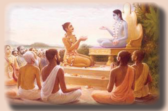
Sukadeva Gosvami Instructing King Pariksit